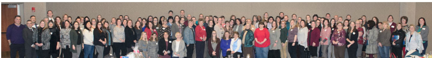
2019 STEM Teacher Dinner